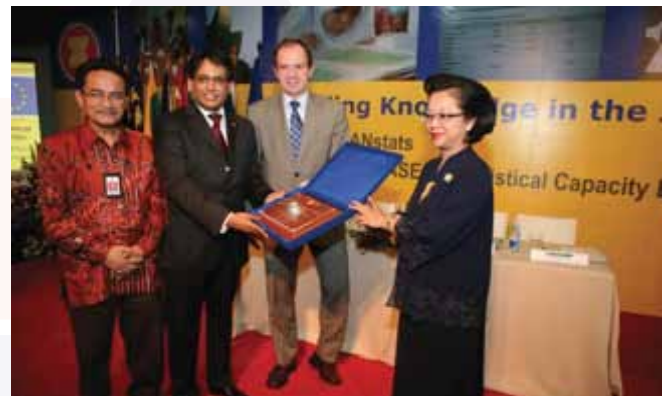
Launch of the ACSS Committee, 4th November 2011, Jakarta, Indonesia.

The EU-ASEAN Statistical Capacity Building (EASCAB) Programme provided assistance for institutional building through the